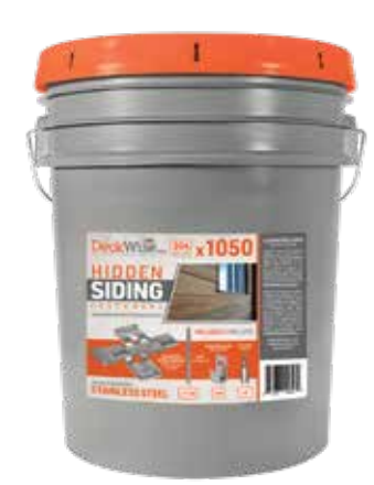
Stainless Steel Screws